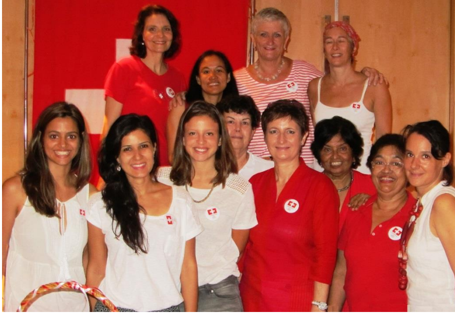
The Swiss Ladies Charity Group 2015

We also request you to get in touch with us if you or any other people you know have extra weight or luggage allowances and are willing to transport food items for us from Switzerland to Sri Lanka. We can arrange for the items to be bought and delivered to you and/or your friends.